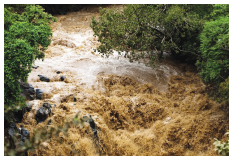
Rainfall and Flood Monitoring