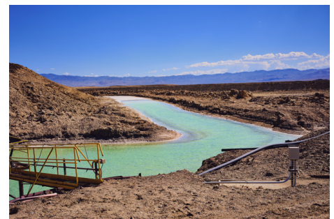
Water Use Monitoring and Management