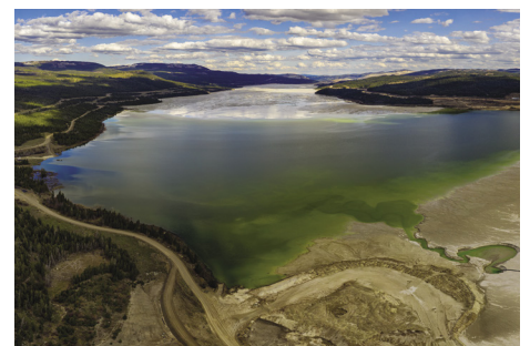
Dam and Soil Erosion Monitoring