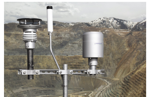
Precision Weather Stations and Environmental Sensors