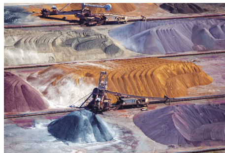
Air Quality and Dust Monitoring