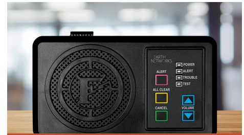
Informer Control Box