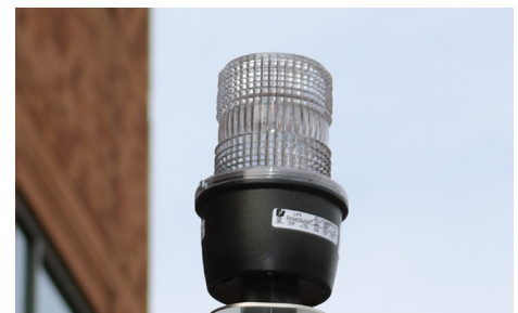
Automated Strobe Lights